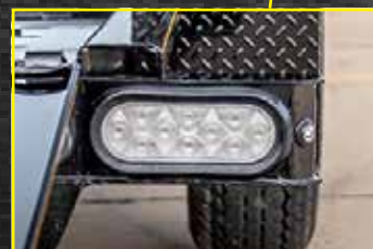
Flush Mount Lifetime Warranty LED Lighting