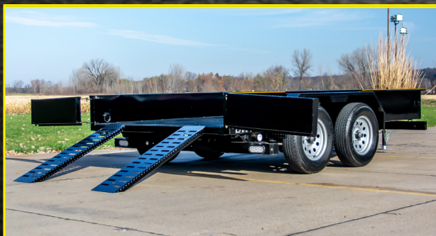
Heavy Duty 5' Self Store Ramps