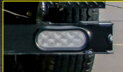
Flush Mount Lifetime Warranty LED Lighting