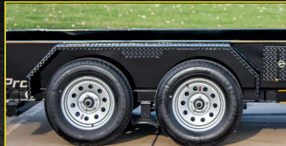
HD Tear Drop Diamond Tread Fenders