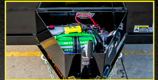
Interstate Marine Grade Battery And Charging Port